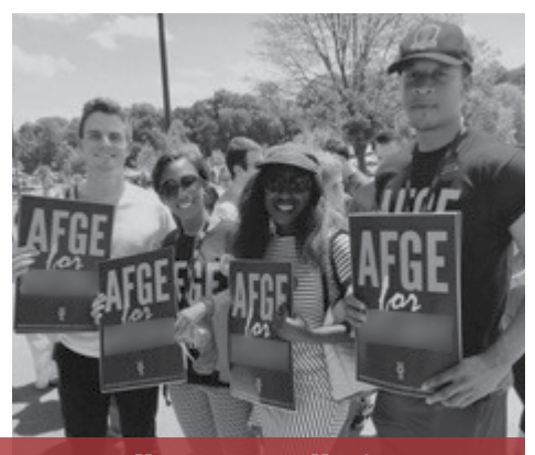
2016 Fellows at a rally for AFGE

I was assigned a lot of different tasks, from drafting and translating press releases to on-line investigation and filling petitions for U.S. Customs seeking enforcement action under the Tariff Act. I would say that my work was very interesting and self-fulfilling. I am 100% sure now that I want to work on global issues.