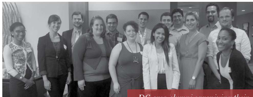
DC area alumni organizing their Alumni Association Chapter